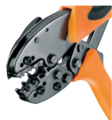
Crimpit IT 6 S