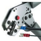
Crimpit IT 2,5 L

For processing terminals and connectors (details p. 115):